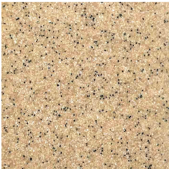
24 - CANYON (キャニオン)