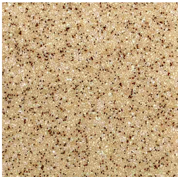
21 - SAHARA (サハラ)