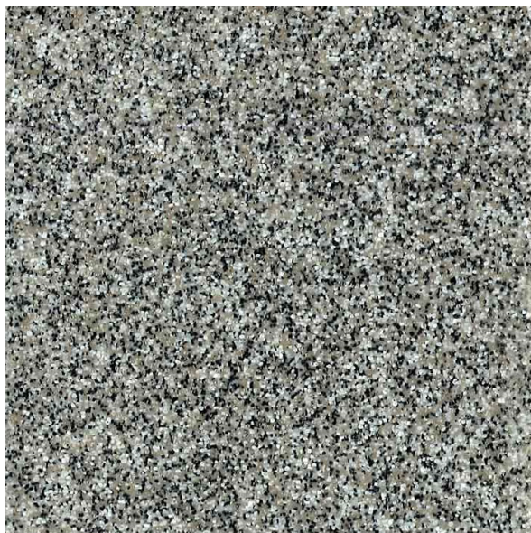
22 - PENINSULA (ペニンシュラ)