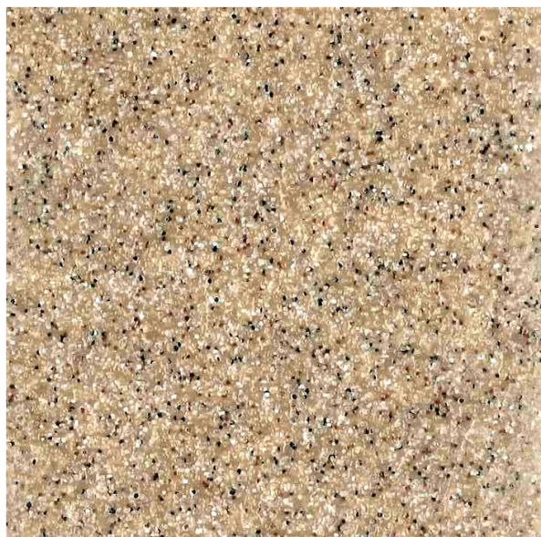
25 - SANDHILL (サンドヒル)